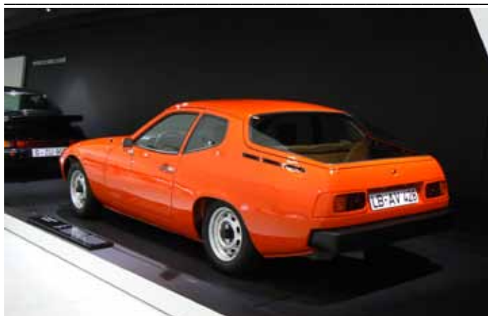
Original 924 concept.