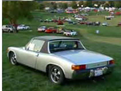
Also on June 16, Orange Coast Region held their Concours on the grounds of the Shady Canyon Golf Club in Irvine.