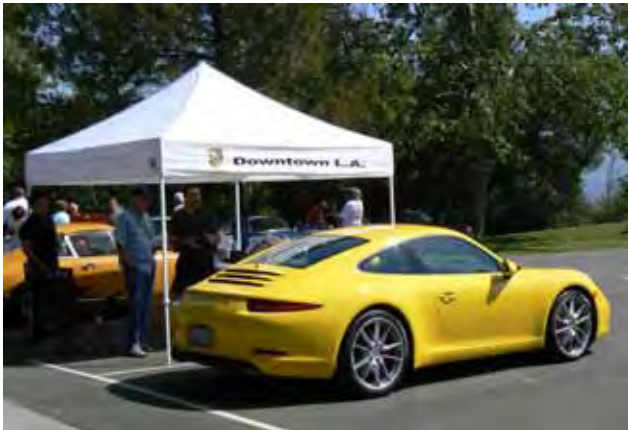
Porsche of Downtown L. A. had one of the new 991's on display.

As viewing time approached, we tried out the special "solar safe sunglasses". The friendly assembled spectators