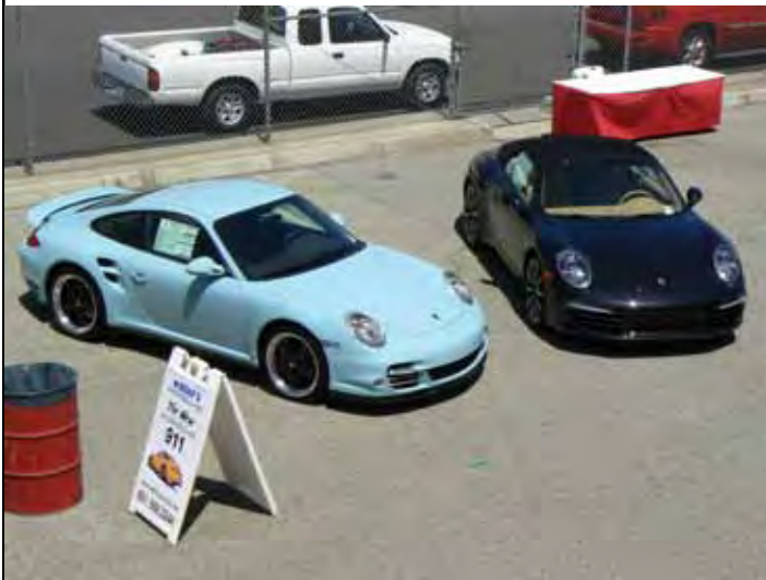
Walter's Porsche (Riverside) had two of the new 991's on display.