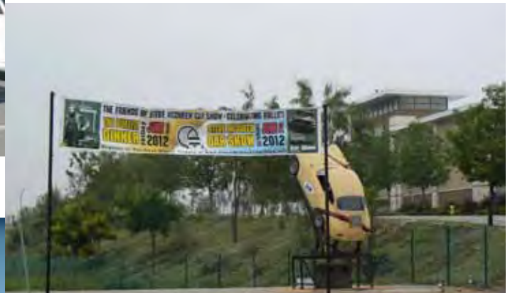
The Friends of Steve McQueen Car Show was held at Boys Republic on Saturday, June 2 in Chino Hills.