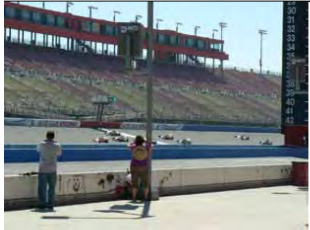
HSR cars taking the green flag during practice.