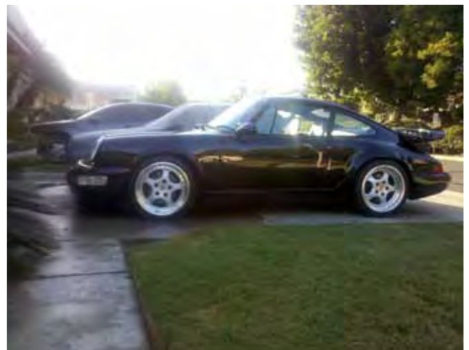
Ed Asencio's 964 C2