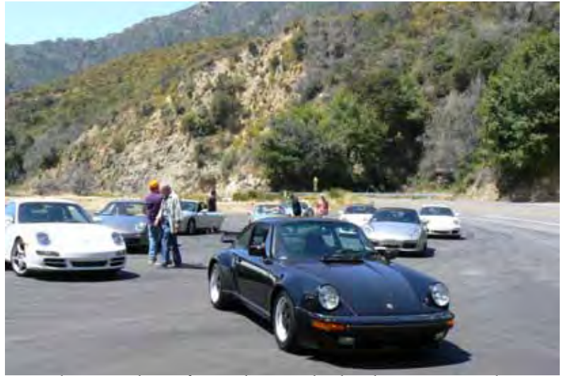
Partial group shot of cars that made the drive up Angeles Crest Highway on Saturday, June 16 for lunch at Newcomb's Ranch. Below, on the road again...