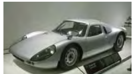
Above Right: 1962 Porsche 804 Formula 1. Right: 1964 Porsche 904 Carrera GTS.